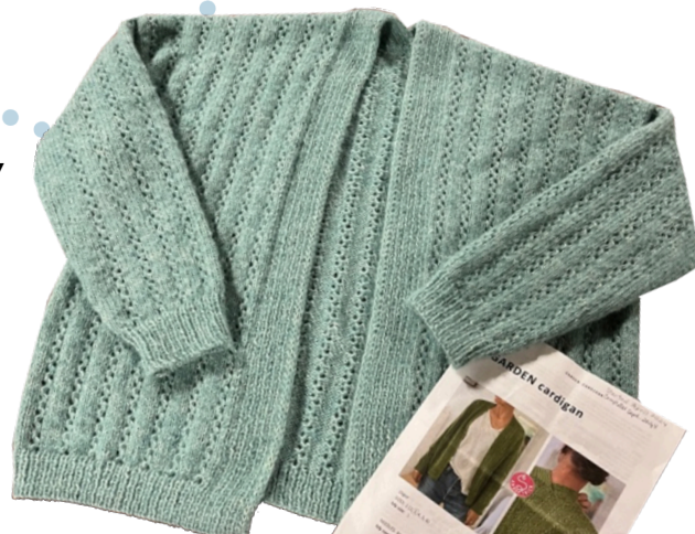
Adult sweater by Sue Culbertson