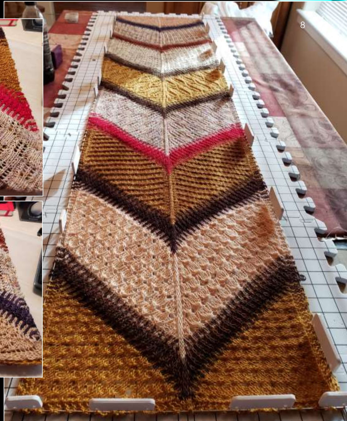
Tidings to Ewe (Craftvent 2020) By Teresa Furnish