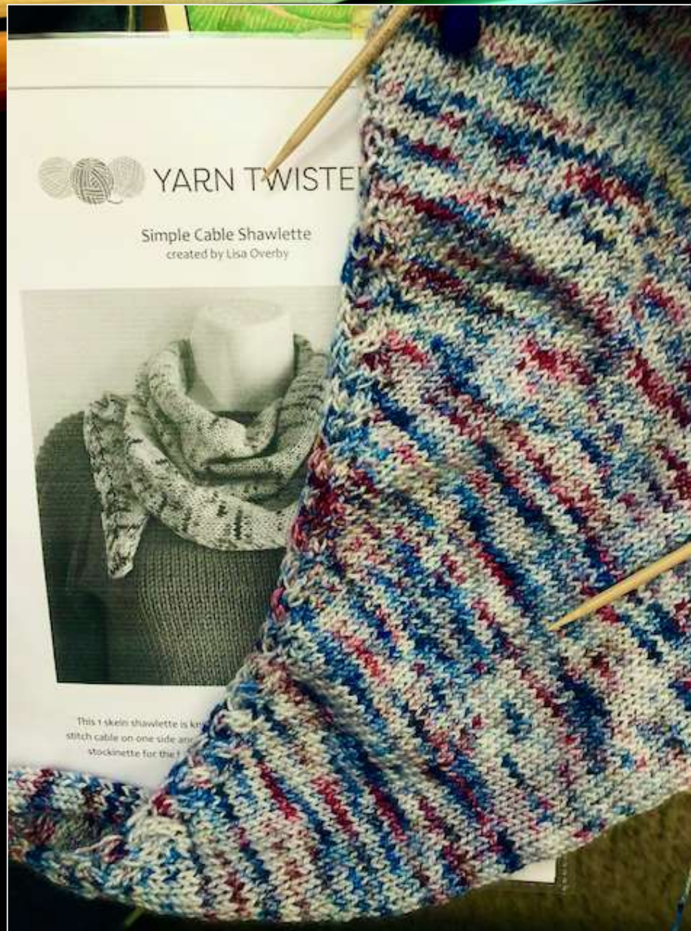
Simple Cable Shawlette By Cindy Barrick