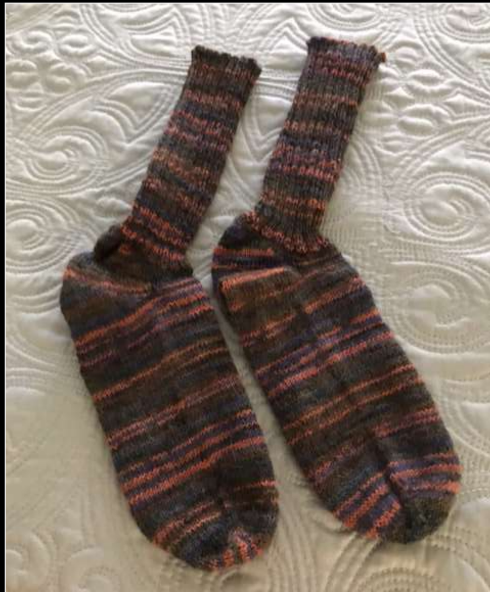
Basic Socks w/ 1x1 rib By Patty Scruggs