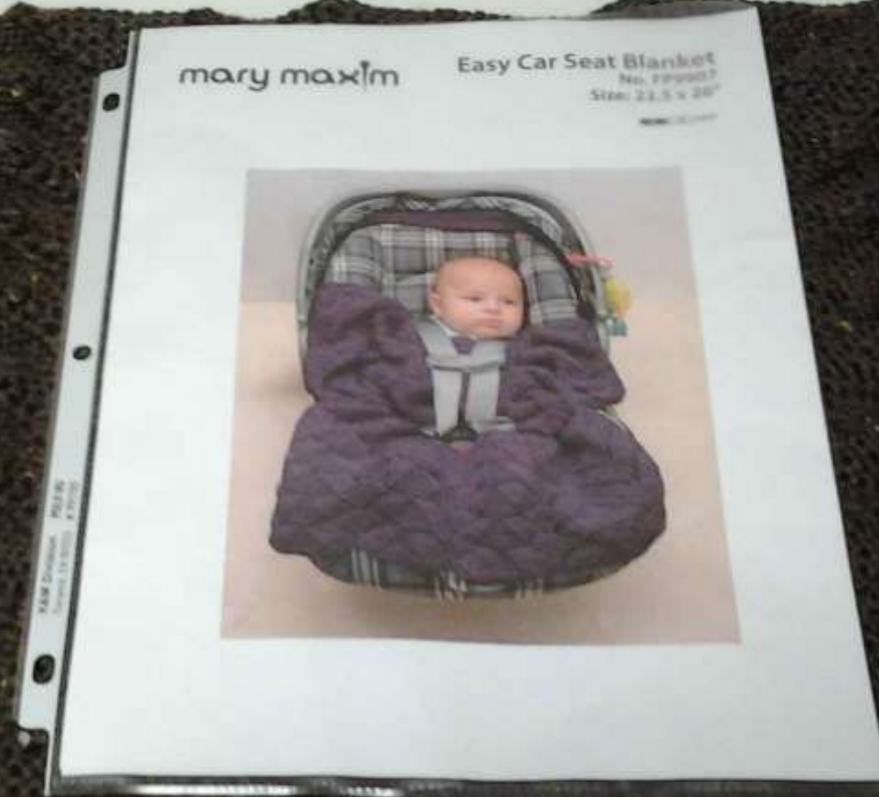
Easy Car Seat Blanket By Su Fennern