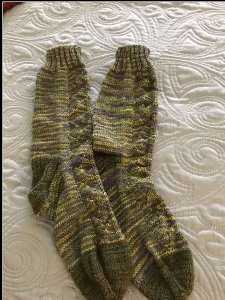
Dragon Scale Socks By Patty Scruggs