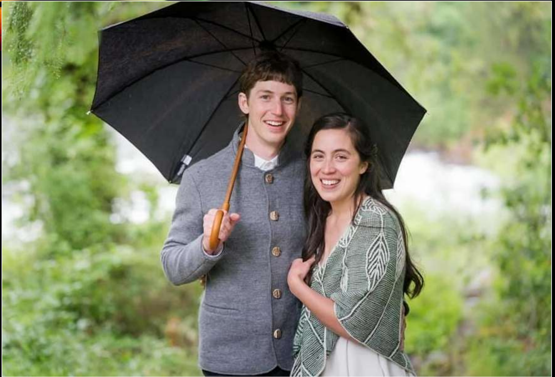
The groom, the bride, and the wedding shawl By Patty Scruggs