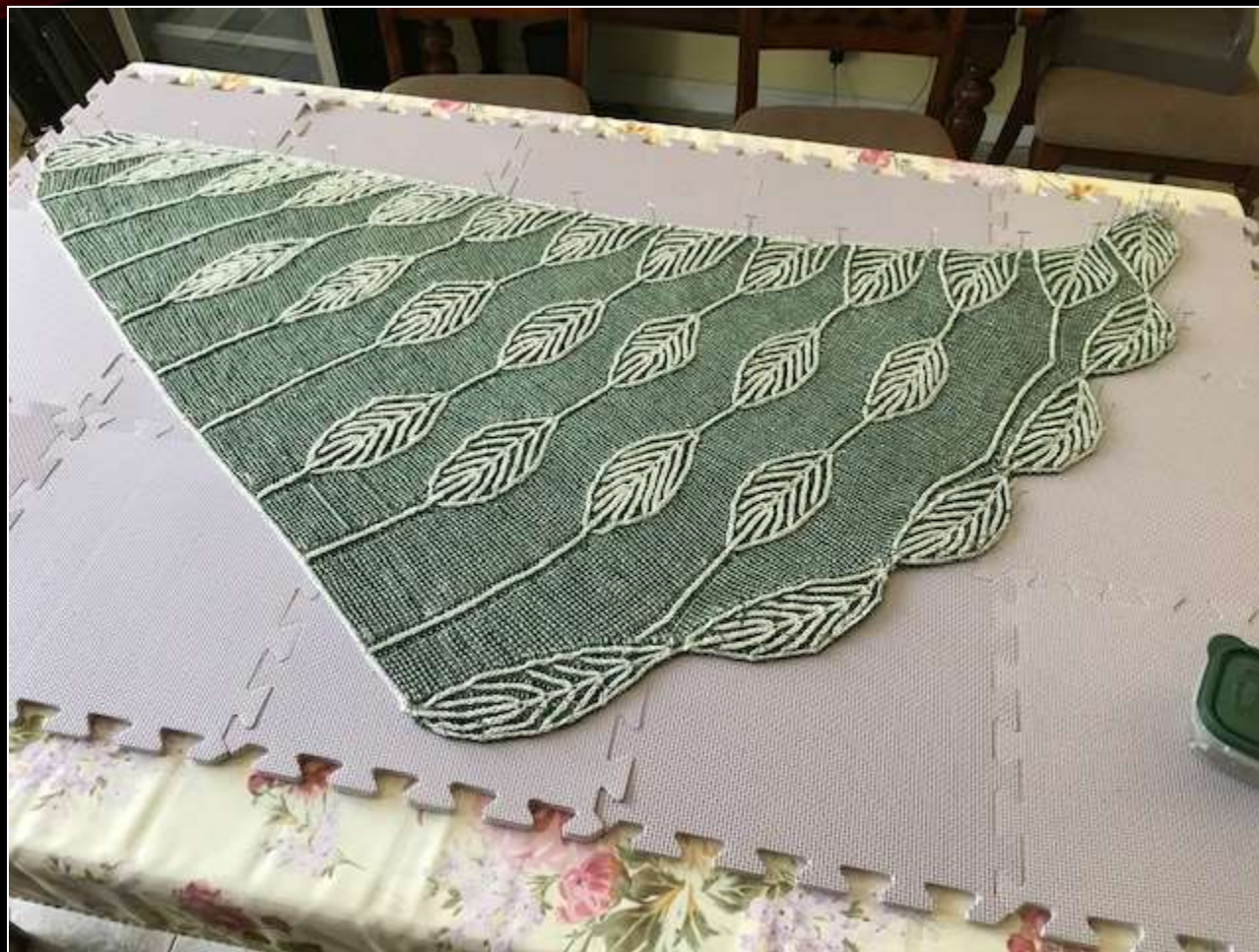
Granddaughter's Wedding Shawl By Patty Scruggs