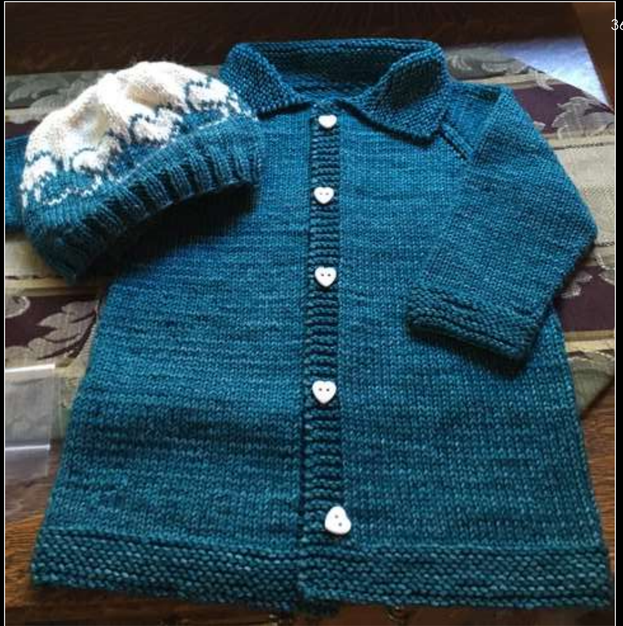
By Susan Hawkins (P.S. The buttons aren't actually sewn on.)