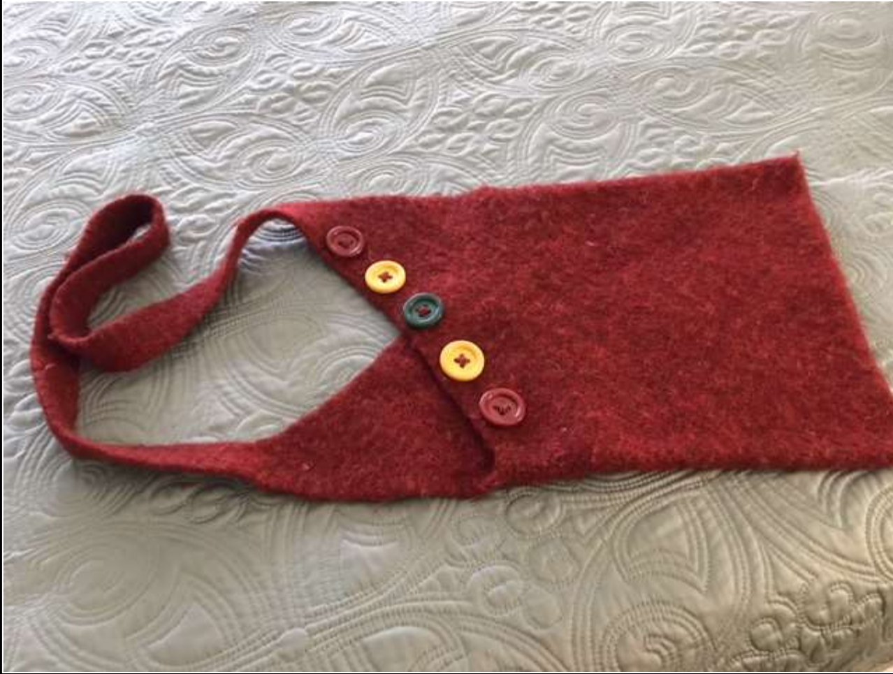
Felted Bag By Patty Scruggs